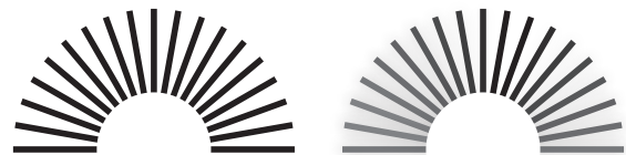
The “Astigmatism Fan” as seen without and with astigmatism

A common test that optometrists use for astigmatism is called the “Astigmatism Fan”. This consists of radial lines and is viewed with one eye at a time. If some lines look black while others are grey it is an indication that the person has astigmatism.