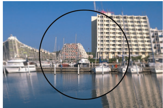
A blurred & distorted view corrected by a lens for astigmatism

Astigmatism is also corrected with refractive surgery,